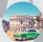
CARIBBEAN & CENTRAL AMERICA