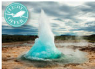
NORTHERN EUROPE AIR OFFER FREE ROUNDTRIP ECONOMY AIR OR UPGRADE TO BUSINESS CLASS AIR FROM $599 EACH WAY