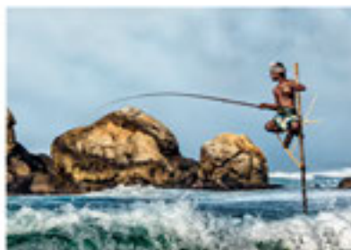
NEW EXPEDITION COLLECTION ALL-INCLUSIVE