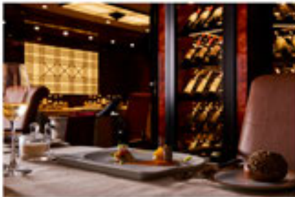
LA DAME FRENCH