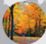
CANADA & NEW ENGLAND