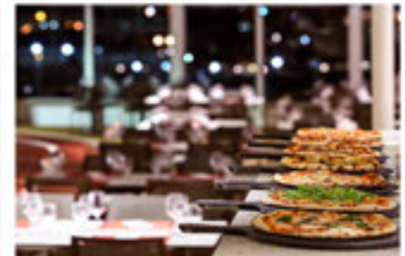
SPACCANAPOLI ITALIAN PIZZERIA