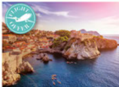
MEDITERRANEAN AIR OFFER FREE ROUNDTRIP ECONOMY AIR OR UPGRADE TO BUSINESS CLASS AIR FROM $599 EACH WAY