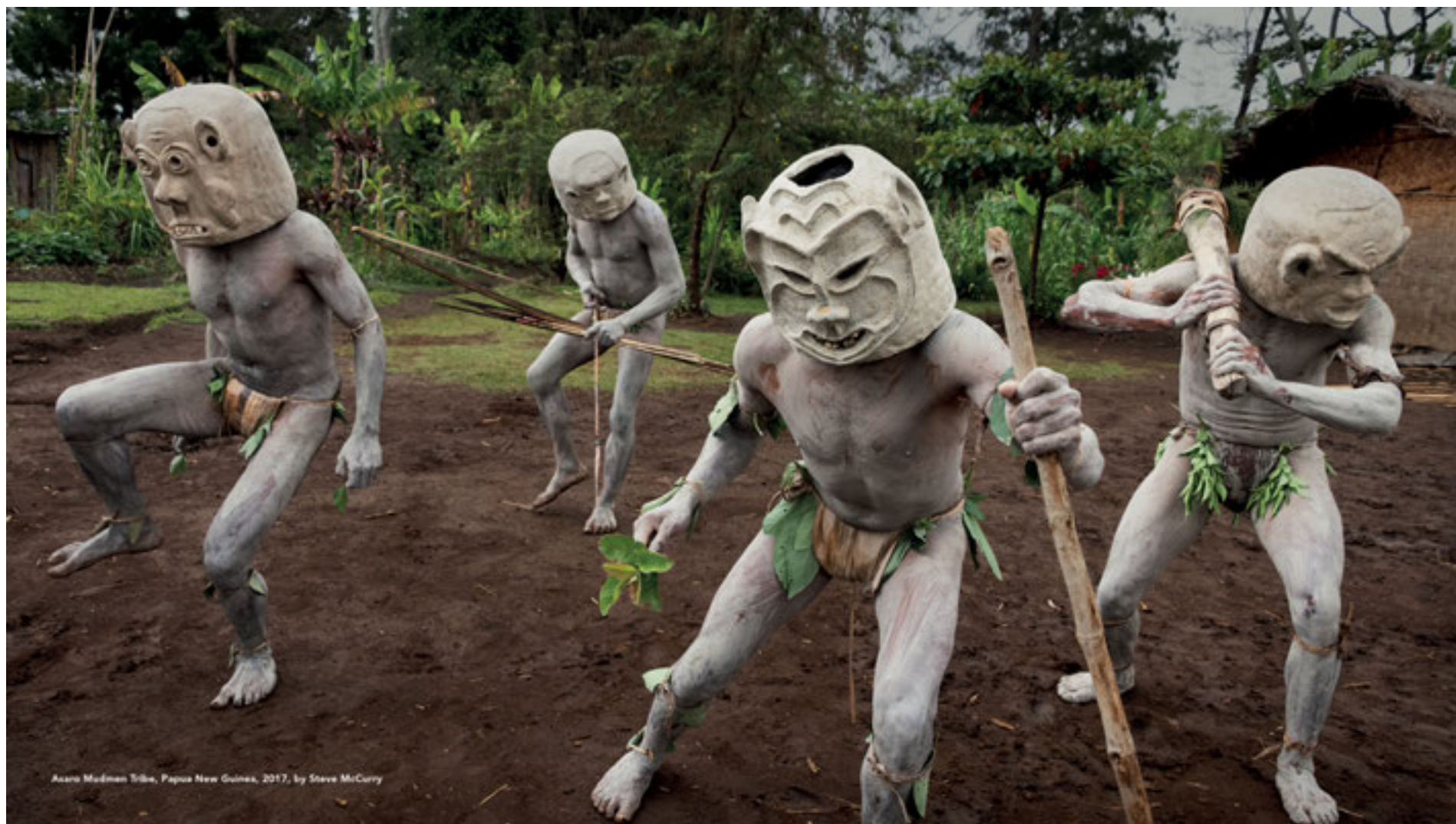
Aka Madmen Tribe, Papua New Guinea, 2017, by Steve McCurry