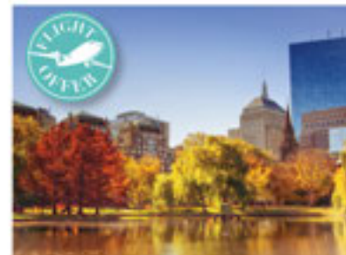
CANADA & NEW ENGLAND AIR OFFER FREE ROUNDTRIP ECONOMY AIR OR UPGRADE TO BUSINESS CLASS AIR FROM $199 EACH WAY