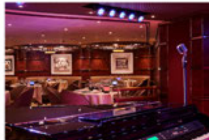
SILVER NOTE INTERNATIONAL