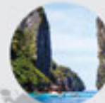
SOUTH PACIFIC ISLANDS