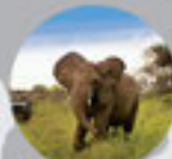
AFRICA & INDIAN OCEAN