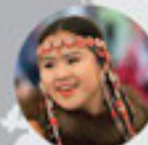
RUSSIAN FAR EAST