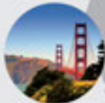
AMERICAN WEST COAST