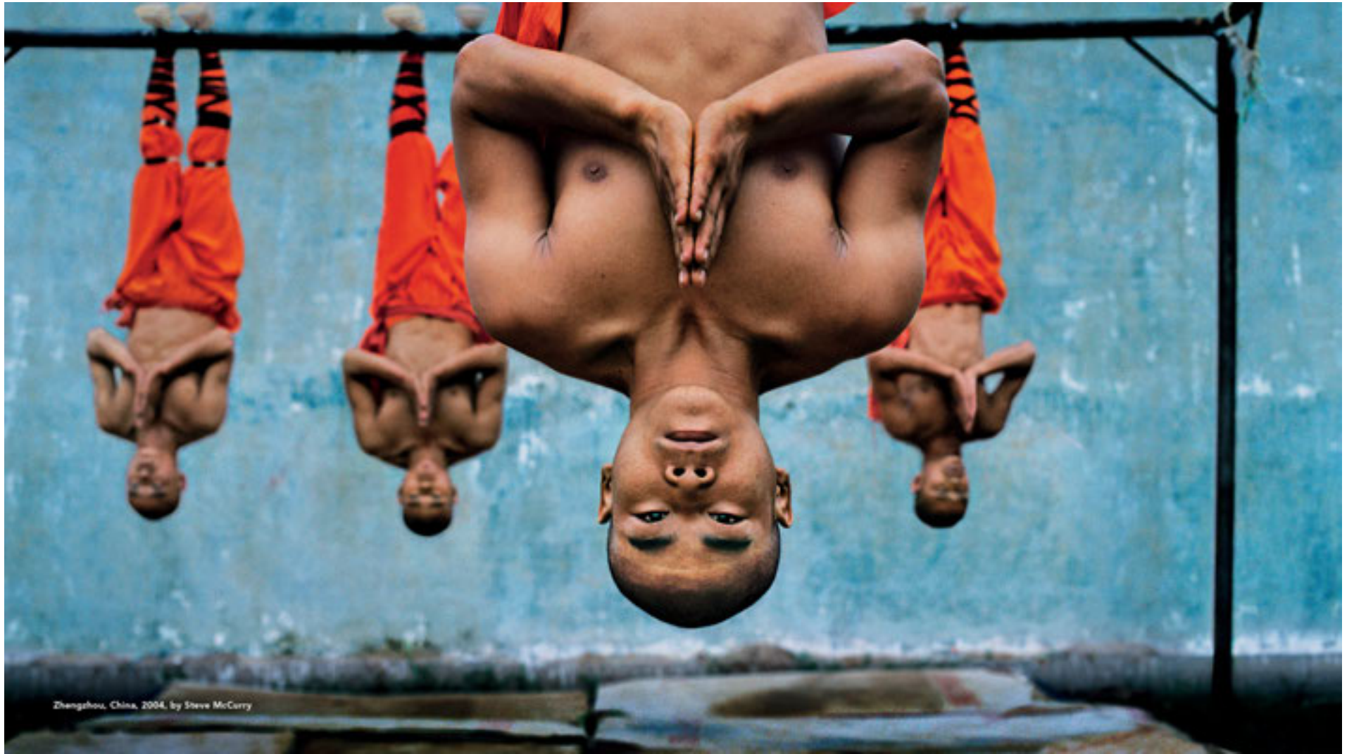
Zhengzhou, China, 2004