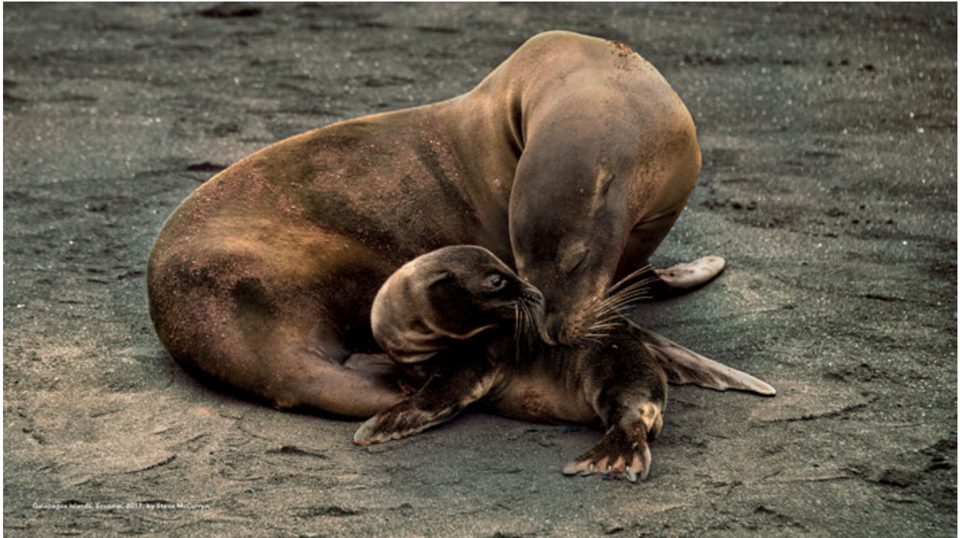
Galapagos Islands, Ecuador, 2017