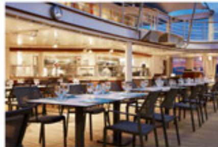
THE GRILL LAVA STONE