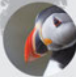
ARCTIC & GREENLAND