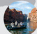
AUSTRALIA & NEW ZEALAND