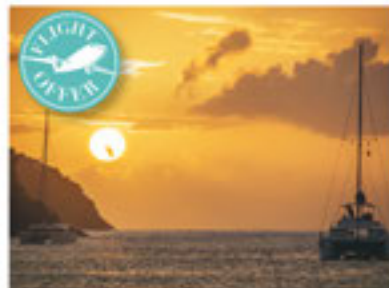
CARIBBEAN AIR OFFER FREE ROUNDTRIP ECONOMY AIR