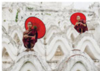
FAR EAST AN ALL-INCLUSIVE ADVENTURE