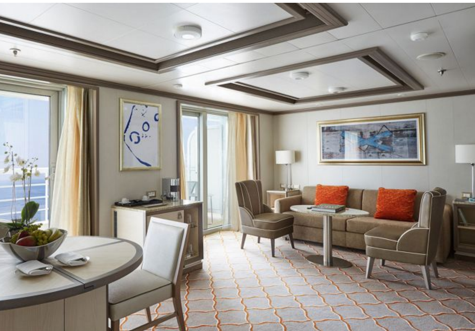
SILVER SUITE 786 SQ. FT.