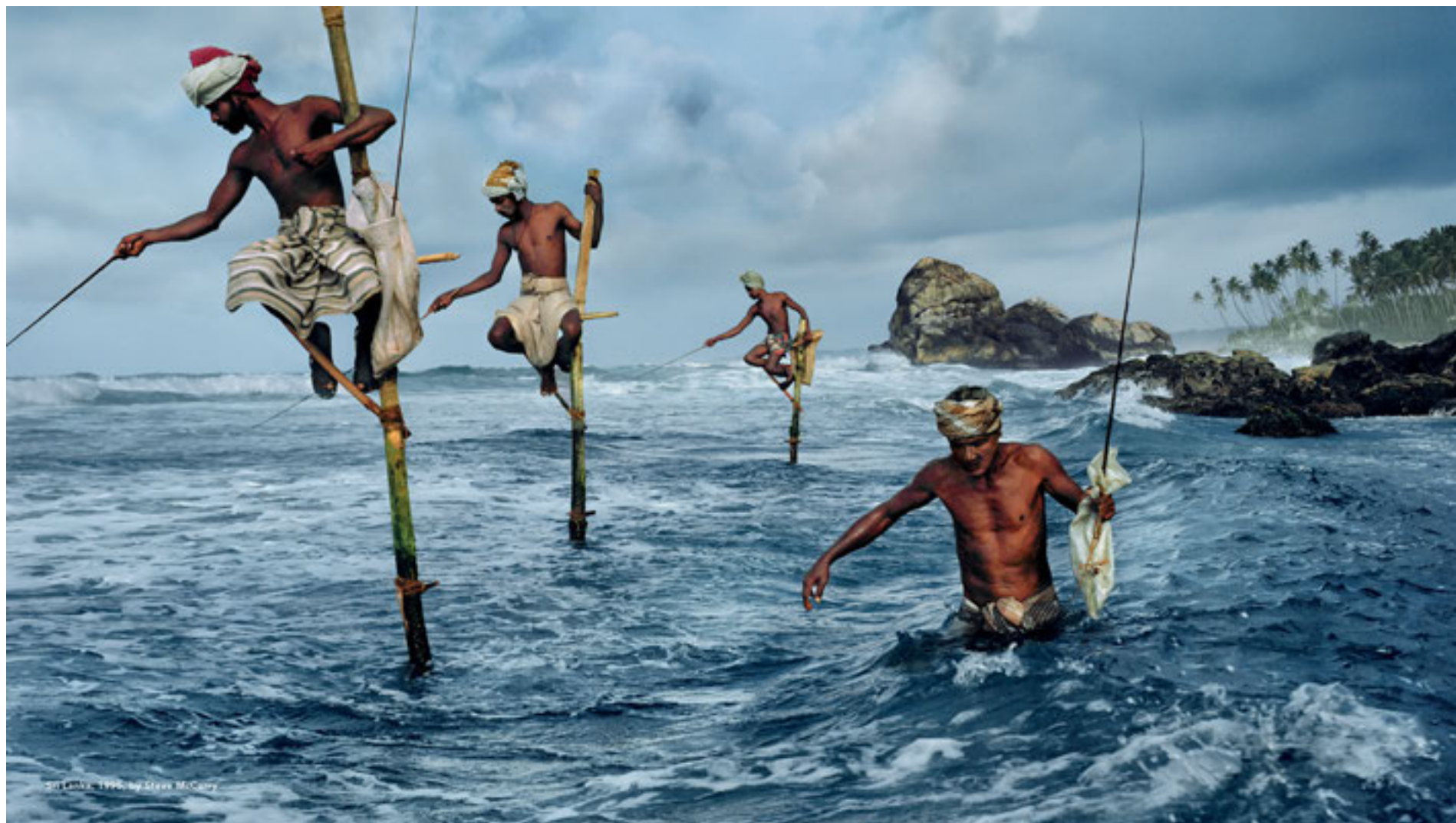
Surf Fishing, 1996, by Steve McCurry