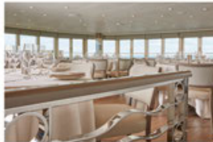
LA TERRAZZA ITALIAN