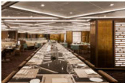
INDOCHINE ASIAN FUSION